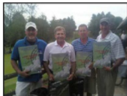
2009 Low Gross Winners

Interested in helping with the 2010 Golf Outing? Call Amy Ervin at 412-330-7667.